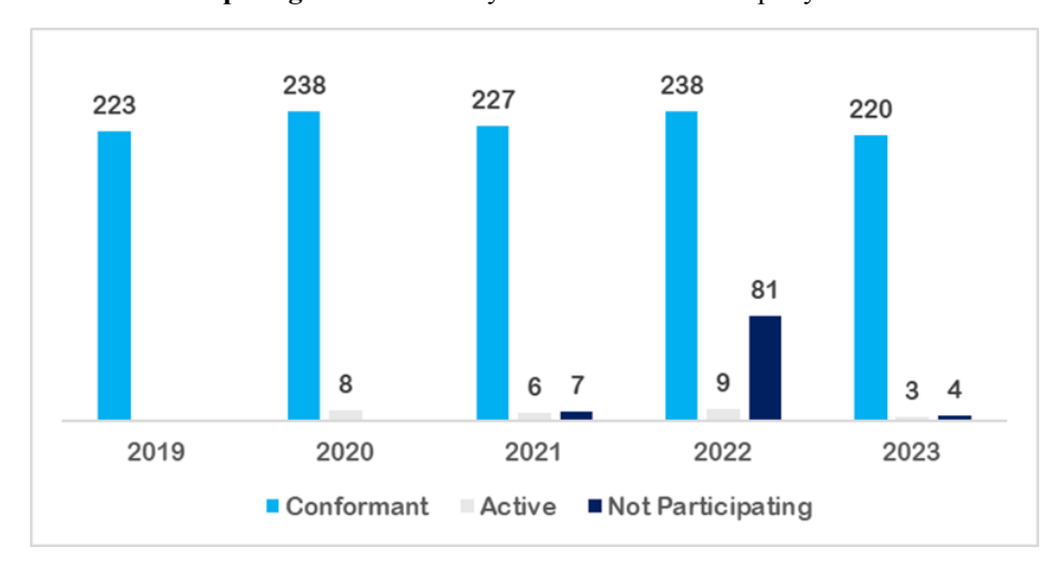
Figure 2: SOR Participation Status* by Metal for the Reporting Period