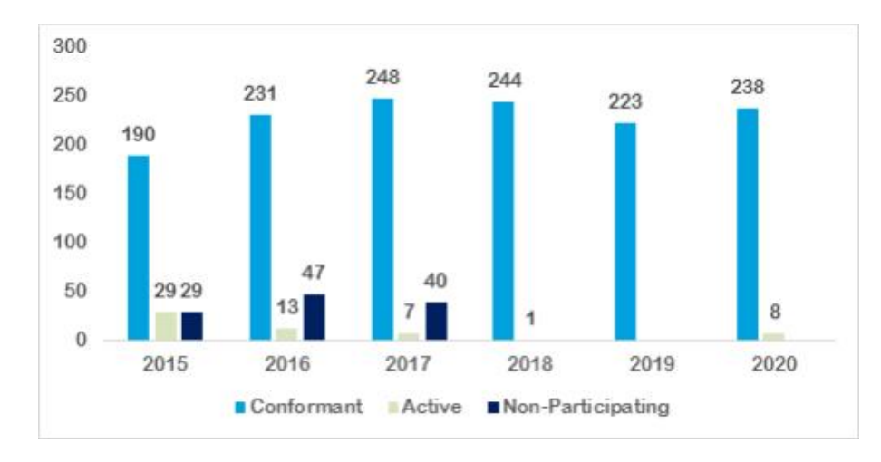
Figure 2: RMAP Participation Status by Metal for the Reporting Period